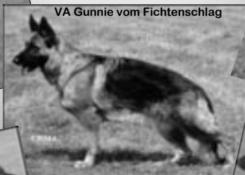
VA Gunnie vom Fichtenschlag