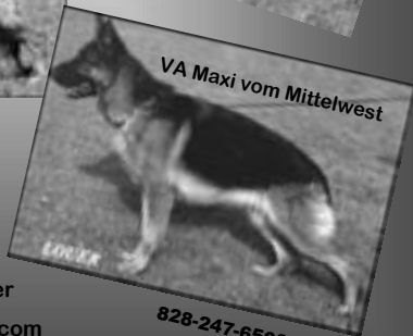
VA Maxi vom Mittelwest