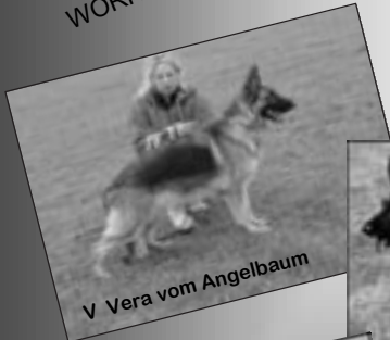
V Vera vom Angelbaum