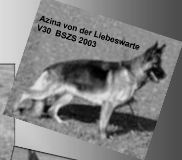
Azina von der Liebeswarte V30 BSZS 2003