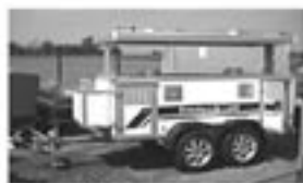
Komfort De Luxe